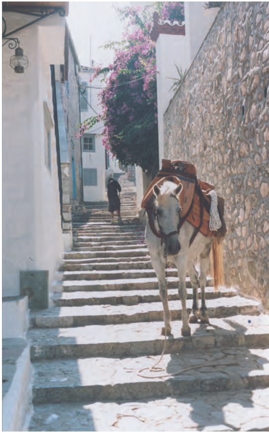
Typical Hydra "street"

Dates: The dates are determined by the instructor and are usually in the spring and fall. We stay 2 days in Athens and 11 days in Hydra.