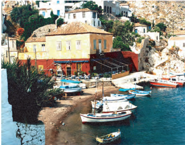
Village of Kamini

H ydra is an island of compelling beauty, traditional architecture and rich history, an island seemingly untouched by modern civilization. It is a favorite spot for sophisticated people the world over who appreciate the absence of all motorized vehicles, and enjoy its lively nightlife and variety of restaurants and tavernas.